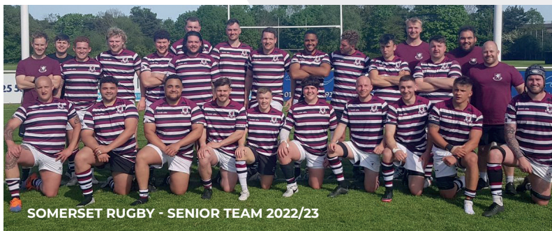
SOMERSET RUGBY - SENIOR TEAM 2022/23