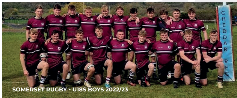
SOMERSET RUGBY - U18S BOYS 2022/23