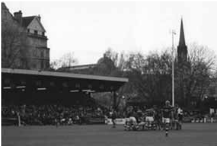
Bath United v Somerset RFU

As always the competition does not run successfully without input from a lot of people across the County. They are too many to mention but the Unions thanks must go to the participating clubs and their volunteers who made sure the games happened, to the referees who officiated and their administrators for making sure the games were appointed to and lastly to the clubs and their members who provided the necessary facilities to host the games. Hopefully all concerned will have derived enjoyment and other benefits from participation in the competition.